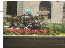
Texture and line