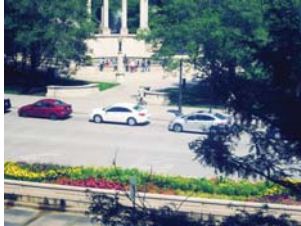
Yellow serpentine as seen from the second floor of the Cultural Center.